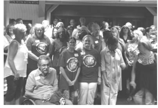
Here I am at my 40 year high school reunion. It's hard to tell in the picture, but I am the tall guy in the back row, center.

really involved in the band and was part of the Big Red Marching Machine. It was always a disappointment that I missed by one year going with the band to the 1972 Olympics in Munich Germany to be a part of the opening ceremonies. I was a freshman at the time and